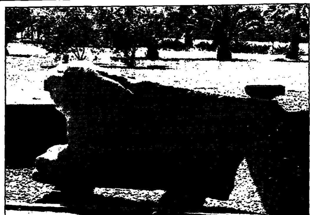
New find at Tel Hazor

"However, implementation of the law depends on both sides, on understanding the essence of friendly Polish-Jewish relations, of using the language of cooperation and dialogue which has been the aim of the Polish legislators."